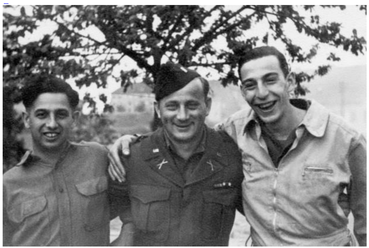
Three of the "Ritchie Boys" who, as German-born Jews, defected to America and helped fight the Nazis